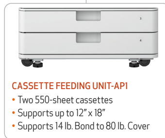
CASSETTE FEEDING UNIT-API